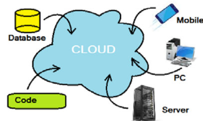
Figure 1. Cloud Model

A cloud based architecture can be defined as a set of resources – hardware and software, which combine together to deliver the aspects of computing as a service. Services in such a scenario are charged on a usage based pricing model and the users are no longer required to care about the intricacies which are needed to be taken care in a traditional on-premise computing model.