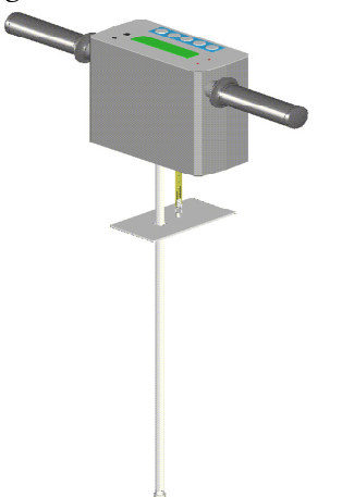
Figure 1. Penetrometer P-BDH 3A

equipment available with electronics and modern processing methods and evaluation techniques can position the field tests keep at the forefront of scientific and agricultural interest.