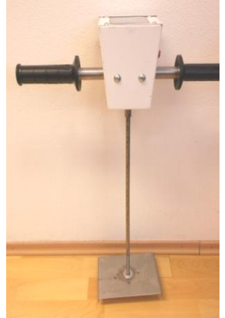
Figure 2. Penetrometer PE 90

Years of experience in the measurement and evaluation of measurement the authors prompted to upgrade the device so as to remove some of the shortcomings of the device in terms of measurement system, as well as increased measurement comfort and control. During the measurement at P-BDH 3A was not possible to follow the course of the measured forces, depending on the depth and it was not able to locate the measurement location by a GPS system.