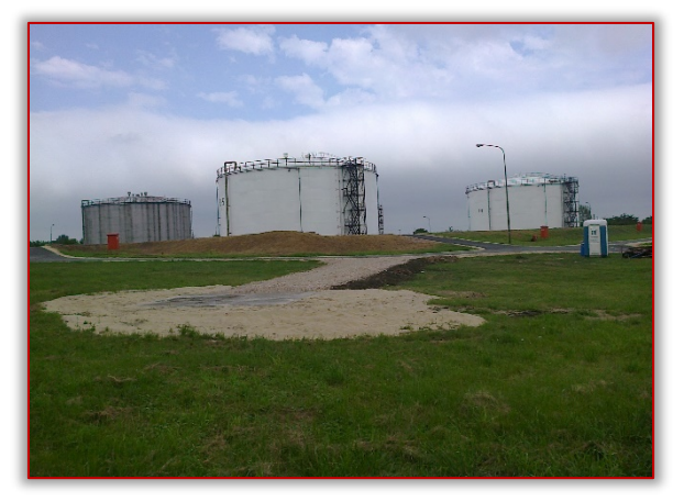
Figure 6. It looks like a tank space

Magistral oil pipelines are usually buried in the ground at a depth of 0.8 to 1.1 m measured from surface of the earth to the upper edge of the pipeline. Depth of digging depends on the category of oil pipeline and the width of the protective belts of the populated areas, the facilities near the pipeline, etc. The depth of burial is Increases to 1 to 1.35 m when various obstacles have to be overcome when laying pipelines: Waterways, roads, railways, etc. The depth is then measured from the bottom of the water flow, respectively from the upper edge of the road, rail, etc. Sometimes the main pipelines are laid above the ground on concrete Columns of height from 0.5 to 0.75 m. There are other ways of laying off the main pipelines: Beneath the sea and lakes at various depths, above wetlands, etc.