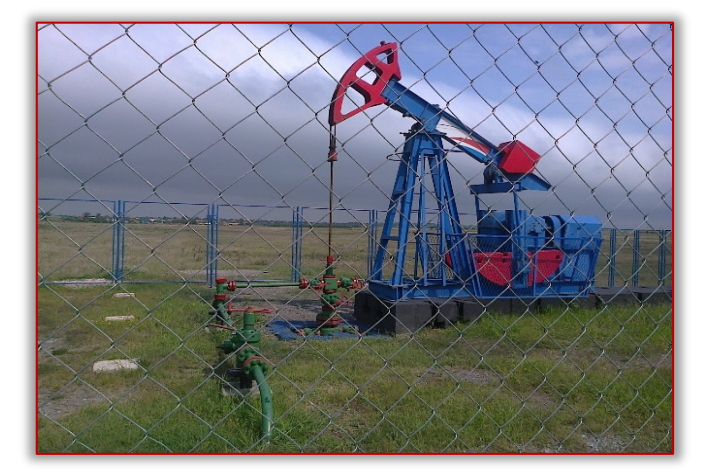
Figure 2. The appearance of the pump well

Gas-lift wells are those in which the oil pressure in the well is not sufficient to expel oil into the surface of the earth. Due to this, at a certain depth, a gas under pressure, which flows, is injected It vertically pushes up crude oil upward so that oil goes up to the surface of the earth.