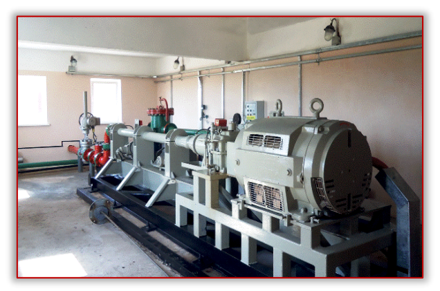
Figure 4. Pump station

performs measurement of physical properties of crude crude oil.