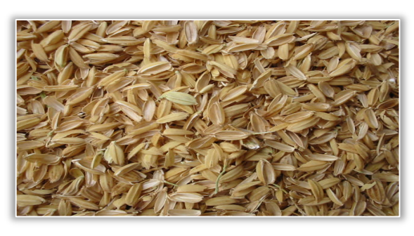
Figure 3: Rice straw (a) and Rice husk (b)

Acharya and Samantrai (2012) studied the wear and friction behaviour of rice husk using randomly oriented unmodified (Araldite LY556 and hardener HY 951). A pin on-disc apparatus was used to study the wear behaviour of rice husk sample was attached to a holder and then abraded under different loads of 5, 7.5,10 and 15N. Each test was conducted for duration of 5 minutes.