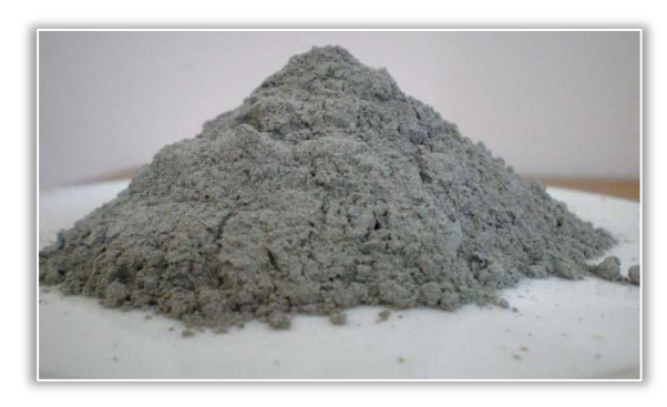
Figure 10: Fly ash

Fly ash shown in Figure 10 is the finely divided residue obtained from the combustion of pulverized coal and is transported from the combustion chamber by exhaust gases. It is generally captured by a particle filtration equipment such electrostatic precipitators before the flue gases reach the chimneys of coal fired power plants. This waste generated by thermal power plants poses a great environmental concern (Anushree & Alka, 2009).