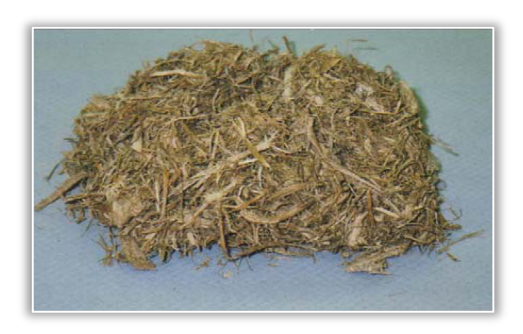
Figure 6: Bagasse (Source: Punyapriya, 2007).

little amounts of soluble solute. The percentage contribution Also, it was observed that with increase in temperature, the of each of these components in bagasse depends on the harvesting techniques. Bagasse contains about 30% hemicelluloses, 40% cellulose, and 15% lignin (Punyapriya,