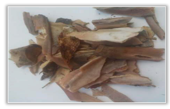
Figure 9: Cow Bones. Isiaka and Temitope (2013) investigated the influence of particle size distribution of cow bone powder on the mechanical properties of polyester matrix composites with the aim of considering how suitable it is to be applied as biomaterials. During the study, the cow bone used was thoroughly washed to get rid of unwanted materials and then crushed into smaller particles sizes using hammer. Sieve size analysis was conducted on the crushed bones and was sieved into three sieve sizes of 300, 106 and 75 µm.

Due to large number of cows being slaughtered daily in the Nigeria, cow bones as shown in Figure 9 are abundantly available. These natural fibers are obtained from cow wastes which causes environmental pollution. Isiaka and Temitope (2013) reported that cow bone exhibit excellent structural compatibility in addition to the surface compatibility requirements as biomaterials. Mayowa et al. (2015) also reported that cow bone consists of living cells which are renewed constantly in the bone and widely scattered within a non-living material known as the matrix formed by osteoblasts cells. It was also reported that this osteoblasts in the bone secrete and makes protein collagen, which gives the bones elastic property which help it withstand stresses generated by lifting, walking, and other related activities.