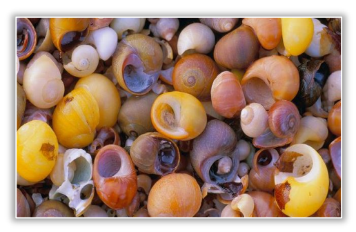
Figure 8: Periwinkle shells

Periwinkles shown in Figure 8 are small marine snails belonging to the family Littorinidae (class Gastropoda, phylum Mollusca). They are widely distributed shore snails which are usually found on stones, rocks or pilings. Some are found on mud flats while some tropical forms are found on the prop roots or mangrove trees. The shell of periwinkles is the outer casing of the animal which is usually discarded after the flesh inside is consumed. They are usually considered as agricultural waste products in riverine area of southern Nigeria (Yawas et al., 2013).