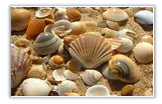
Figure 13: Seashells (Norazlina et al., 2015)

Natural materials such as seashell (exoskeletons of mollusks) is made up of three distinct layers which include the smooth inner layer composed mainly of calcium carbonate, intermediate layer (calcite) and the outer layer of horny substance known as conchiolin (Schaeffer, 2014). Norazlina et al. (2015) reported that seashell as shown in Figure 13 primarily consist of calcium carbonate (CaCO<sub>3</sub>), been naturally above 80% CaCO<sub>3</sub> by weight with only about 2 % protein content and no complex extraction process is needed to use it for composite production.