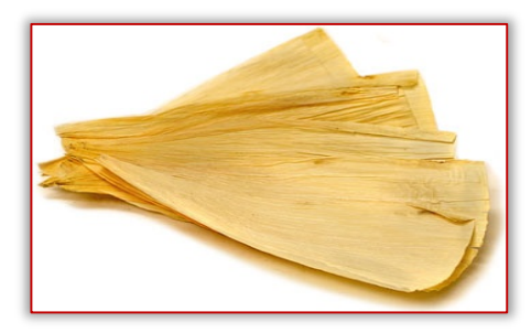
Figure 7: Maize husk

Ademoh and Adeyemi (2015) conducted a study using maize husks as reinforcement material to produce automotive brake pads. Three friction composite compositions were developed using the maize husks as strengthening material with varied epoxy resin binder. Maize husks were grounded and sieved to a mesh size of 300um. Other ingredients used during the study include silica sand, epoxy resin, calcium carbonate, anhydrous iron oxide, talc as release agent and powdered graphite.