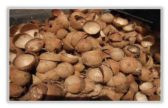
Figure 2: Coconut shells

the remnant of red oil in fiber. The fibers were then washed ratio, low cost, biodegradability, environmental friendly and renewability. Matthew (2012) reported that moisture the degradation of hemicellulose present in the shell and at The results obtained from the study indicated that the 240°C to 350°C, degradation of cellulose take place. The final stage of thermal degradation involves the breakdown of