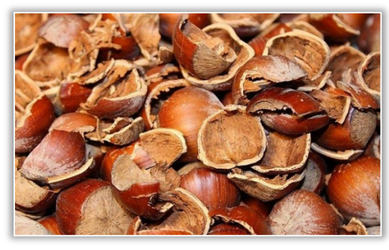
Figure 11: Cocoa beans shells (Source: Foodbev Media, 2015) Adevemi et al. (2016) developed asbestos-free brake pad materials using cocoa bean shells (CBS). The materials used for the production of the samples include calcium carbonate, silica sand, anhydrous iron oxide, epoxy resin and graphite. The base material, coco bean shells were prepared by washing, sun-drying, grinding into a fine powder and sieving of grinded powder using a sieve of aperture 300 µm. Three samples were produced by varying the epoxy resin (50–60%) and Cocoa beans shells powder (21–31%) while keeping the calcium carbonate (CaCO<sub>3</sub>), silica, iron oxide and graphite constant at 4, 7, 3 and 5% respectively.

Cocoa bean shells as shown in Figure 11 also called cocoa bean mulch or cocoa bean hull mulch are shells of cocoa bean which come off the beans during roasting process and are separated from the beans by strong air action, therefore insuring a dry weed-free product. Oliver, (2013) reported that the waste shells of cocoa bean are rich in anti-oxidants and fiber which constitute a great potential as brake pad ingredients.