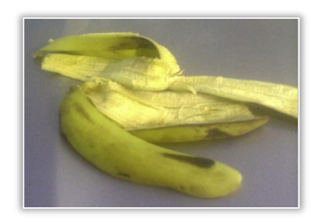
Figure 5: Banana peel.

Banana peels shown in Figure 5 are also known as banana popular fruit consumed Worldwide with a yearly production of over 145 million tonnes. Once the peel is removed, the fruit can be eaten raw or cooked and the peel is generally discarded. Because of this removal of the banana peel, a significant amount of organic waste is generated (Babatunde,