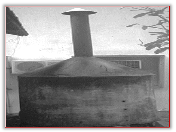
Figure 2. Showing RHA being produce inside ferrous-cement furnace Table 1. Quantities of Materials per Cubic meter of Concrete for various Batch

Figure 1. Showing rice husk being milled to produce GRH Rice husk is burnt approximately 48 hours under controlled combustion process inside ferrous-cement furnace to produce rice husk ash (RHA). The burning temperature was within the range of 600°C to 850°C (Figure 2). The ash obtained is ground in a ball mill for 30 minutes and its color was seen as grey