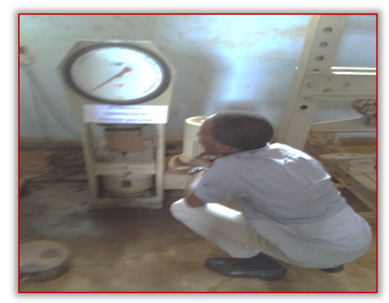
Figure 3. The compression testing machine

The top surface was leveled and smoothened with a trowel. The specimens were marked for identification and stored in moist air for 24 hours and later removed from the moulds. Compressive strength test was performed after curing the samples for 7 days, 14 days and 28 days using compression testing machine (Figure 3).