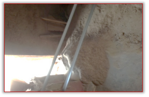
Figure 1. Showing rice husk being milled to produce GRH Rice husk is burnt approximately 48 hours under controlled combustion process inside ferrous-cement furnace to produce rice husk ash (RHA). The burning temperature was within the range of 600°C to 850°C (Figure 2). The ash obtained is ground in a ball mill for 30 minutes and its color was seen as grey

The rice husk used in this work was collected from rice paddy industry in Ikole Ekiti, Ekiti State, Nigeria. Grinded rice husk (GRH) was obtained by milling rice husk inside milling machine (Figure 1).