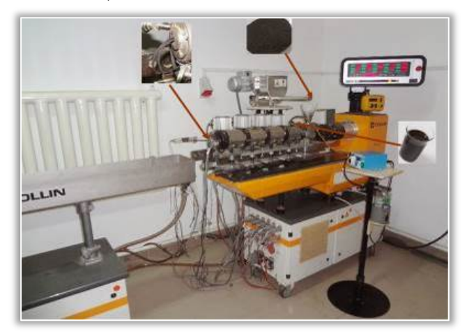
Figure 2 – Extrusion plant type "ZK 25", production Collin

Mixtures dosed through the two feed points of the extruder, Figure 2, are taken up by the two co–rotative screws which homogenize and process them by shearing and heating while being moved to the die. On the other hand, due to the rotation of the screws, there is an increase in pressure to the die.