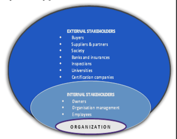
Figure 2. Understanding of the organisation and its context

Stakeholders are acting on the organisation's behaviour in relation to products, services, investments and the joint action of internal and external factors creating a continuous improvement [4].