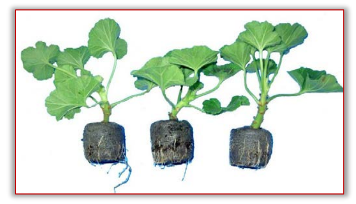
Figure 4- Rooted geranium cuttings, ready to plant in pots ( Toma , 2019).

After performing the process on the mother plants, the new cuttings were obtained which were planted in alveolar pallets, benefiting from a nutrient substrate suitable for the new plants, a factor that helps the optimal vegetative development of the plant, as can be seen in image 3A. The post-walking work of this process is successive transplantation into vessels suitable for the size of the plant, as shown in image 3B.