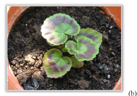
Figure 3- Geranium seedlings (a) ( Toma , 2019). (b) Detail geraniums ( Toma , 2019).

After performing the process on the mother plants, the new cuttings were obtained which were planted in alveolar pallets, benefiting from a nutrient substrate suitable for the new plants, a factor that helps the optimal vegetative development of the plant, as can be seen in image 3A. The post-walking work of this process is successive transplantation into vessels suitable for the size of the plant, as shown in image 3B.