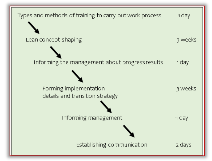
Figure 4. The third step: Shaping the future state

This plan of the future state is presented to the management for approval. The conversation in terms of plan implementation has to be done with all employees, explaining what was observed, who is involved, what was decided, what the aims of the organization are and what all employees involved in are. At this point the project team reach the fourth step.