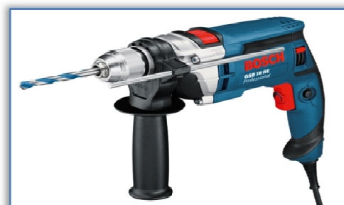
Figure 2. BOSCH GSB 16 RE Professional [3]