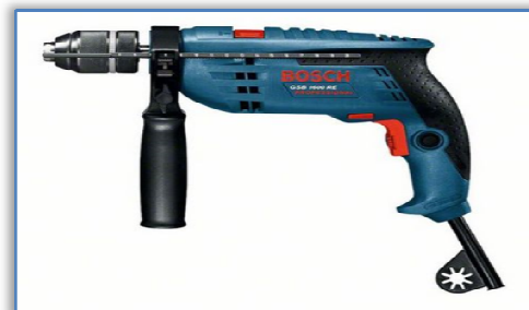
Figure 3. BOSCH GSB 1600 RE Professional [4]