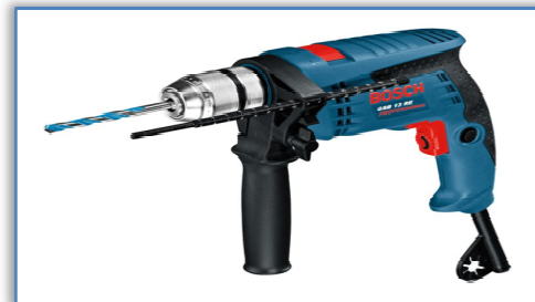
Figure 1. BOSCH GSB 13 RE Professional [2]

For the purposes of the assessment we used Bosch impact drills with different technical parameters. Their graphic representation is shown in Figure no. 1-4.