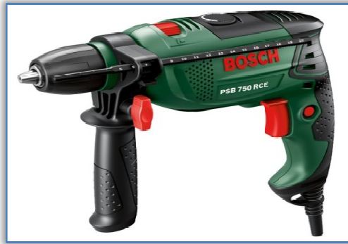
Figure 4. BOSCH PSB 750 RCE [5]