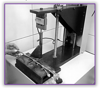
Figure 2. Cutting of carnation stem

5.2\pm0.3 , 5.8\pm0.2 , 6.1\pm0.3 , 5.6\pm0.3 and 4.8\pm0.2