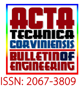
copyright © University POLITEHNICA Timisoara, Faculty of Engineering Hunedoara, 5, Revolutiei, 331128, Hunedoara, ROMANIA http://acta.fih.upt.ro