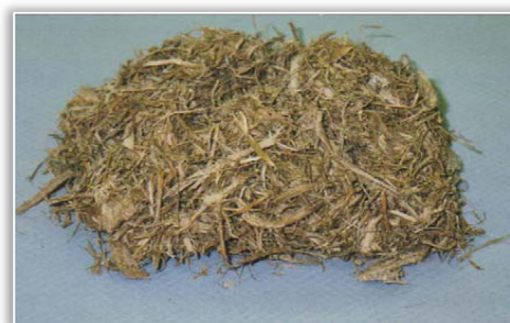
Figure 6: Bagasse.

Bagasse as shown in Figure 6 is a fibrous residue that remains after crushing the stalks. It is composed of fibers, water and little amounts of soluble solute. The percentage contribution of each of these components in bagasse depends on the maturity, variety, efficiency of the crushing plant and the harvesting techniques. Bagasse contains about 30% hemicelluloses, 40% cellulose, and 15% lignin (Punyapriya, 2007).