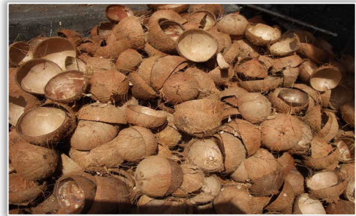
Figure 2: Coconut shells

ratio, low cost, biodegradability, environmental friendly and renewability. Matthew (2012) reported that moisture desorption of coconut shells takes place between 25 and 150°C and at 150°C, degradation of sclerenchyma cells, which are responsible for holding water in the shell occurs. Further heating of the shells between 190°C to 260°C may result to the degradation of hemicellulose present in the shell and at 240°C to 350°C, degradation of cellulose take place. The final stage of thermal degradation involves the breakdown of lignin which occurs between 280°C and 500°C (Matthew, 2012).