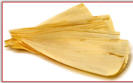
Figure 7: Maize husk

used to encase foods for baking or steaming thereby imparting light maize flavour.