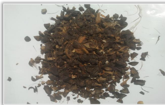
Figure 1: Palm kernel Shell

Ndoke (2006), reported that palm kernel shell as shown in Figure 1, has an average dry density of 0.65\text{mg}/\text{m}^3 , porosity of 28% and an impact value of 4.5%. The report suggested that the dry density, porosity and impact value of palm kernel shell place it in the same category as lightweight aggregate and a good substitute for asbestos.