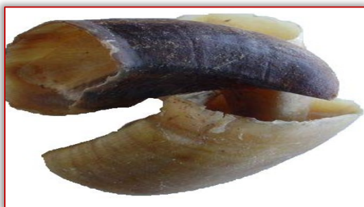
Figure 12: Cow Hooves (Bala et al. , 2016)).

Cow hooves shown in Figure 12 are the horny covering protecting and encasing the foot of a cow.