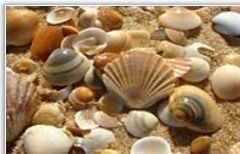
Figure 13: Seashells (Norazlina et al. , 2015)

Natural materials such as seashell (exoskeletons of mollusks) is made up of three distinct layers which include the smooth inner layer composed mainly of calcium carbonate, intermediate layer (calcite) and the outer layer of horny substance known as conchiolin (Schaeffer, 2014). Norazlina et al. (2015) reported that seashell as shown in Figure 13 primarily consist of calcium carbonate (CaCO 3 ), been naturally above 80% CaCO 3 by weight with only about 2 % protein content and no complex extraction process is needed to use it for composite production.