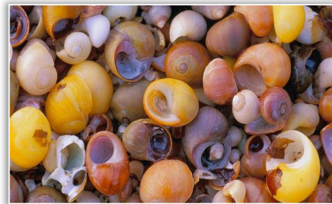
Figure 8: Periwinkle shells

Periwinkles shown in Figure 8 are small marine snails belonging to the family Littorinidae (class Gastropoda, phylum Mollusca). They are widely distributed shore snails which are usually found on stones, rocks or pilings. Some are found on mud flats while some tropical forms are found on the prop roots or mangrove trees. The shell of periwinkles is the outer casing of the animal which is usually discarded after the flesh inside is consumed. They are usually considered as agricultural waste products in riverine area of southern Nigeria (Yawas et al. , 2013).