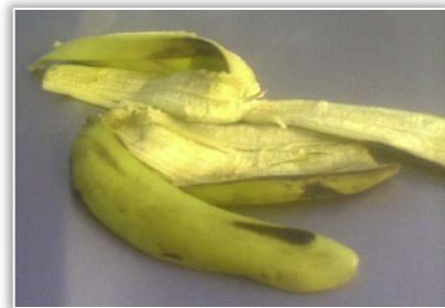
Figure 5: Banana peel (Source: Idris et al. , 2013).

Banana peels shown in Figure 5 are also known as banana skin. They are the outer covering of the banana fruit. It is a popular fruit consumed Worldwide with a yearly production of over 145 million tonnes. Once the peel is removed, the fruit can be eaten raw or cooked and the peel is generally discarded. Because of this removal of the banana peel, a significant amount of organic waste is generated (Babatunde, 1992).