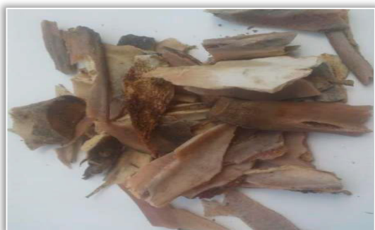
Figure 9: Cow Bones.

Due to large number of cows being slaughtered daily in the Nigeria, cow bones as shown in Figure 9 are abundantly available. These natural fibers are obtained from cow wastes which causes environmental pollution. Isiaka and Temitope (2013) reported that cow bone exhibit excellent structural compatibility in addition to the surface compatibility requirements as biomaterials. Mayowa et al. (2015) also reported that cow bone consists of living cells which are renewed constantly in the bone and widely scattered within a non-living material known as the matrix formed by osteoblasts cells. It was also reported that this osteoblasts in the bone secrete and makes protein collagen, which gives the bones elastic property which help it withstand stresses generated by lifting, walking, and other related activities.