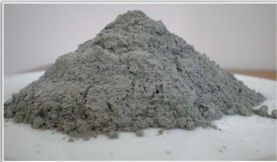
Figure 10: Fly ash

Fly ash shown in Figure 10 is the finely divided residue obtained from the combustion of pulverized coal and is transported from the combustion chamber by exhaust gases. It is generally captured by a particle filtration equipment such electrostatic precipitators before the flue gases reach the chimneys of coal fired power plants. This waste generated by thermal power plants poses a great environmental concern (Anushree & Alka, 2009).