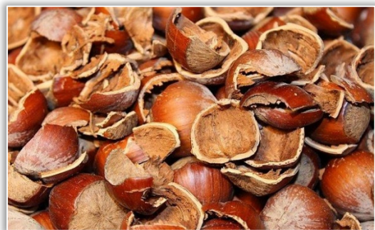
Figure 11: Cocoa beans shells

Cocoa bean shells as shown in Figure 11 also called cocoa bean mulch or cocoa bean hull mulch are shells of cocoa bean which come off the beans during roasting process and are separated from the beans by strong air action, therefore insuring a dry weed-free product. Oliver, (2013) reported that the waste shells of cocoa bean are rich in anti-oxidants and fiber which constitute a great potential as brake pad ingredients.