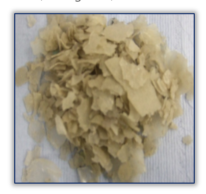
Figure 3. Recycled polyvinyl butyral [8]

Polyvinyl butyral, which forms a safety interlayer in windscreens or building glasses, by material recovery takes the form of flakes having a size of 2-20 mm and a thickness of 0.5 mm to 1.5 mm (see Figure 3).