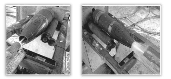
Figure 4. Delaboration of projectile by applying WJW technology

Delaboration of projectile using WJW technology is based on the principle of high-pressure explosive loading (Figure 4). Unlike AWJ technology, in the WJW process there is no physical destruction of the missile shell. In this way, it is possible to re-use the missile shell.