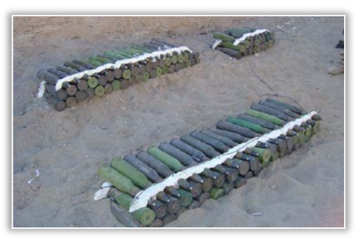
Figure 1 Contamination of the environment during the processing EO

Chemical elements such as Pb, Sb, Ba and toxic gases found in combustion products such as hydrochloric, carbon monoxide, nitrogen monoxide, nitrogen dioxide and hydrogen cyanide are easily get in and retain in soil and underground waters [2]. Table 1 shows the emission of toxic gases through the