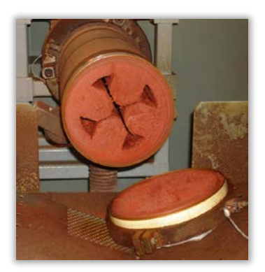
Figure 3. Delaboration of rocket engines and high caliber projectile by applying AWJ technology

Delaboration of projectile using WJW technology is based on the principle of high-pressure explosive loading (Figure 4). Unlike AWJ technology, in the WJW process there is no physical destruction of the missile shell. In this way, it is possible to re-use the missile shell.