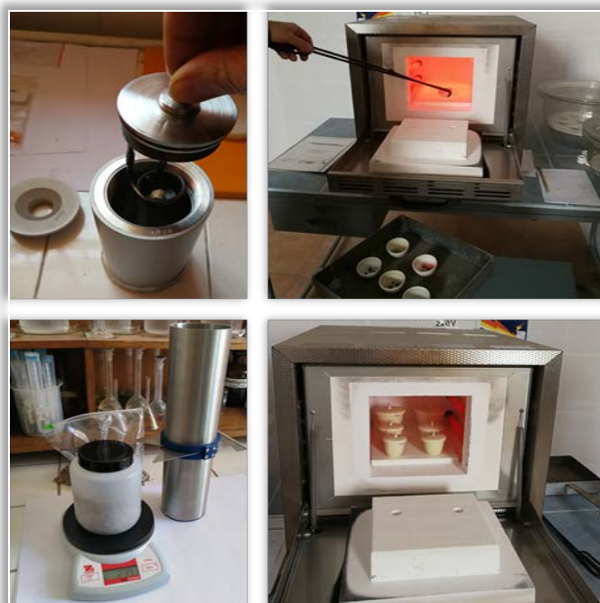
Figure 2. Aspect during the experiments

Pellet density was determined by giving the pellet samples a cylindrical shape by sanding the irregularities resulted from the pelleting process and weighing each sample.