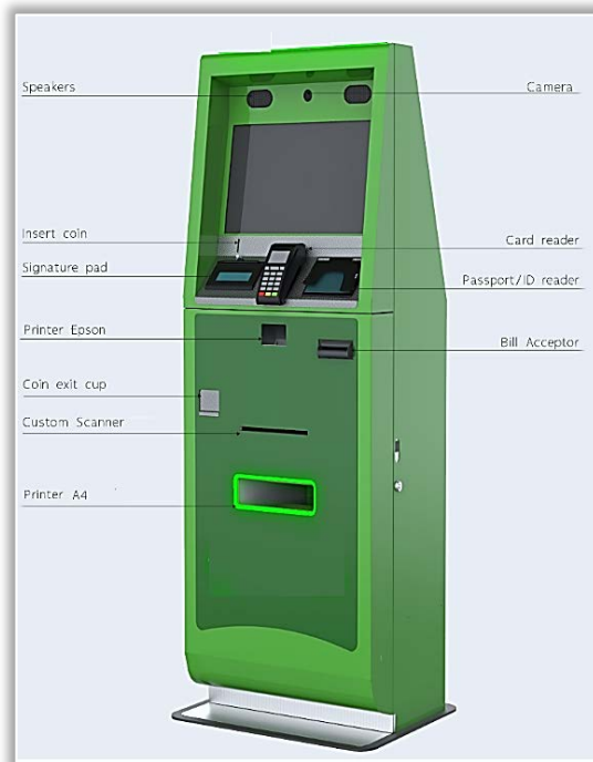
Figure 2. Proposed design of implemented modern digital smart banking teller/counter service device

Figure 2 shows proposed and practically designed and implemented smart teller/counter device used in a bank for purpose of automating and robotizing of the banking teller/counter services. All used equipment in the device implementation is shown and indicated in Figure 2.