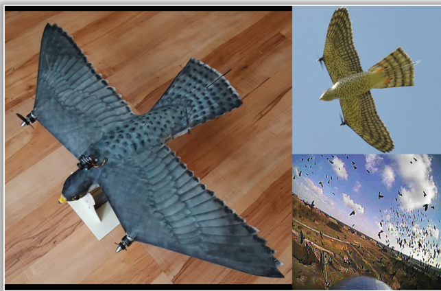
Figure 2. The RobotFalcon (Storms R.F.et al., 2022)

A different approach is taken by Muda N.R.S. et al., 2024 and Muda N.R.S. et al. 2025, who developed an eagle-like drone with flapping wings. With a wingspan of 2 meters and a payload of 1 kg, the drone produces a noise of only 10 dB, making it almost inaudible. This feature is essential for camouflage and reducing the acoustic impact on wildlife. Although initially geared towards military applications, the platform can be adapted to deter birds.