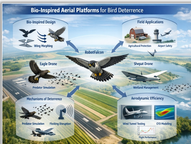
Figure 1. Conceptual diagram on the integration of collective avian behavior, bioinspired design and aerodynamic optimization in the development of aerial platforms to deter birds.

Figure 1 proposes a systemic model in which the interaction between collective flock dynamics, morphological biomimetics and aerodynamic optimization constitutes a closed functional circuit. The integrative approach suggests that the effectiveness of the deterrence does not depend exclusively on the visual realism of the platform, but on the fine correlation between aerodynamic parameters (CL/CD, stability, moment control) and interception trajectories that maximize the disruption of the collective structure of the flock.